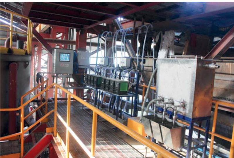
Automated RIF proportioning machine at processing plant, Carmen Copper Corporation

automation department to design facilities and devices for automatic control of process flows and has its own production facilities to manufacture a wide variety of equipment for mineral mining and processing.