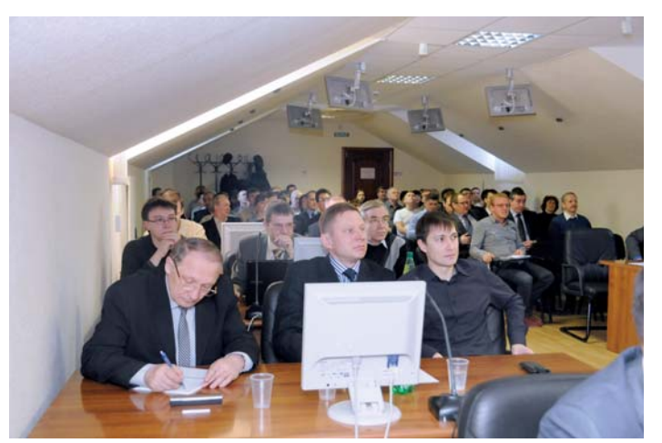
Annual scientific session of Mining Institute of Ural Branch of Russian Academy of Sciences