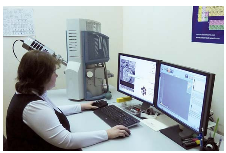
Scanning electronic microscope Tescan VEGA 3 LMH

party. Institute has in its efficient management: in Perm — administrative building 549 m<sup>2</sup>, laboratory building with the annex 2250 m<sup>2</sup>, underground parking for 10 cars; in Beresniky settlement