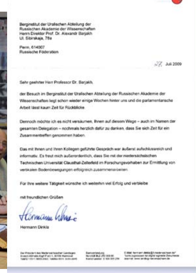
Visit of delegation of langtage of the region Lower Saxon (Germany) and gratitude for great creative co-operation between Mining Institute of Ural Branch of Academy of Sciences and Klaustalsky Technical University