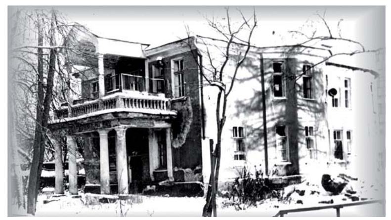
Beginning of the Mining Institute of Ural Branch of Russian Academy of Sciences