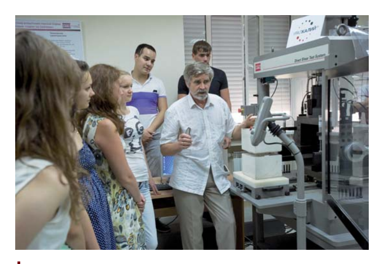
Laboratory of physical and mechanical testing at the higher educational-academic chair